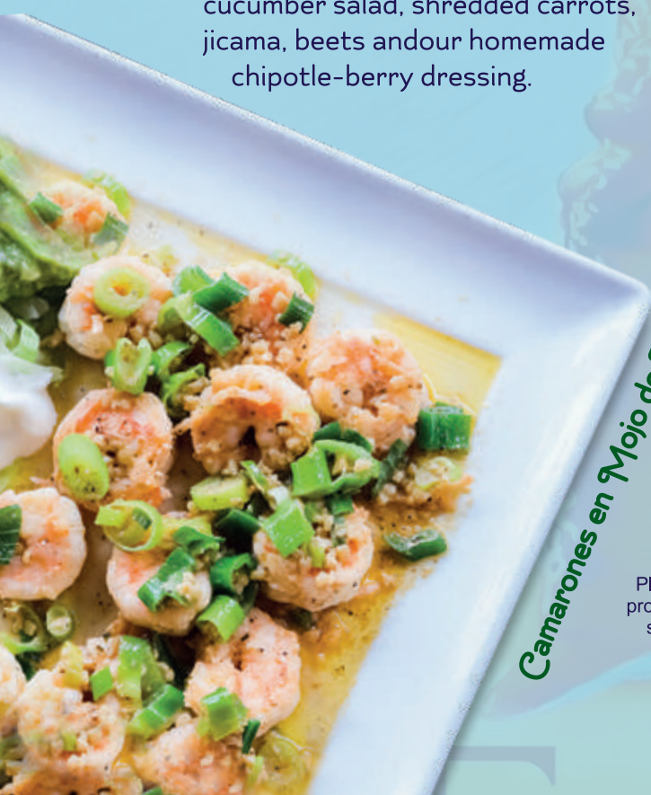
Camarones en Mojo de Ajo

Hearty soup full of shrimp, fish, scallops, clams, mussels, crab and octopus.