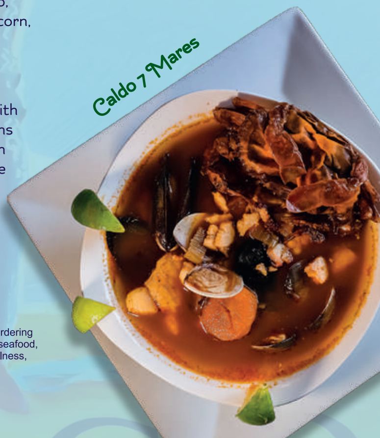
Caldo 7 Mares

Please notify us of any known food allergies during the ordering process. Consuming raw or undercooked meats, poultry, seafood, shellfish, or eggs may increase your risk of foodborne illness, especially if you have certain medical conditions.