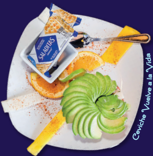
Ceviche Vuelve a la Vida