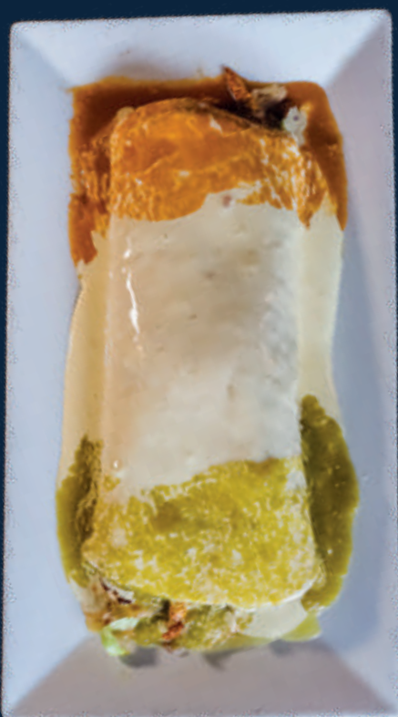
Las Carretas Burrito

Your choice of beef, chicken or pulled pork. Filled with lettuce, sour cream, shredded cheese, pico de gallo, guacamole, rice and refried beans. Topped with queso dip and burrito sauce.